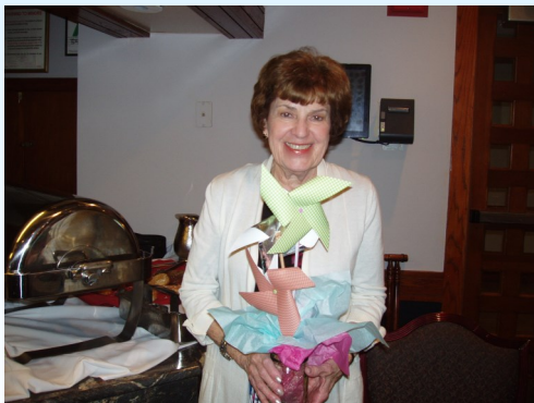
The Joint Brunch concluded with the singing of the DKG Song. Everyone left the gathering satisfied with